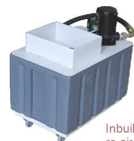
Inbuilt movable re circulation coolant tank