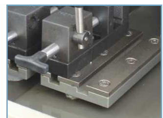
"T" Slot bed