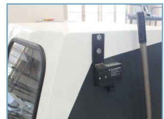
Door safety interlock