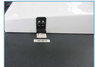
Door limit switch

Machine Color: Enclosures RAL9003, Base & Stand RAL 7021