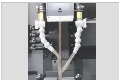
Cut off wheel cooling systems