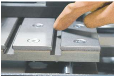
Movable T-Slot Table

Advanced PLC based touch screen system With pre set programs