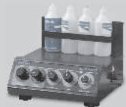
Automatic / Manual with variable Dosing Unit